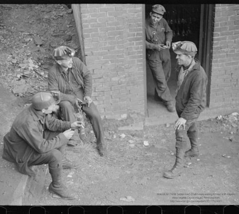
Coalminers waiting for next shift. Caples, West Virginia