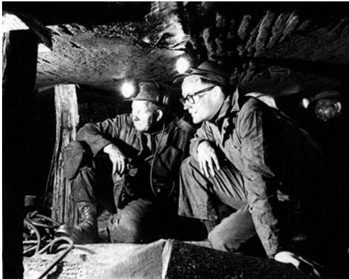
Centers for Disease Control and Prevention Public Health Image Library. Photo ID 9542. Accessed July 19, 2018. Photographer unknown.