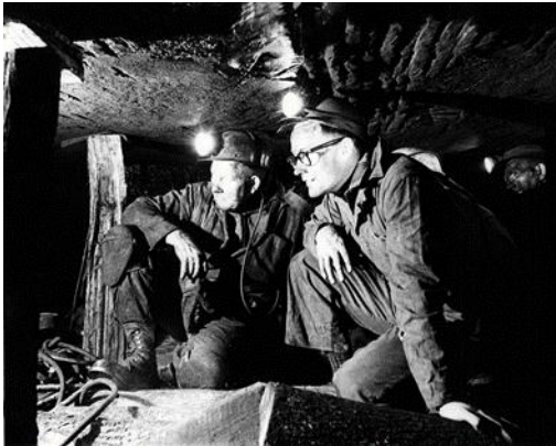
Centers for Disease Control and Prevention Public Health Image Library. Photo ID 9542. Accessed July 19, 2018. Photographer unknown.